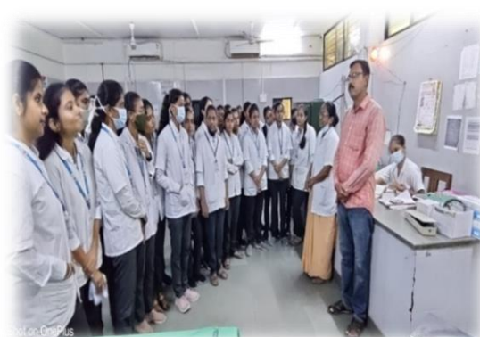
T. Y. B. Pharm students visited to Cottage Hospital Chopda on 21/09/2022